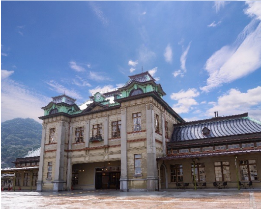
[JR Mojiko Station]

In Mojiko (Moji port) flourished as a important trading port, there are many historic buildings, nostalgic scenery, beautiful views over Kanmon Strait and delicious foods.