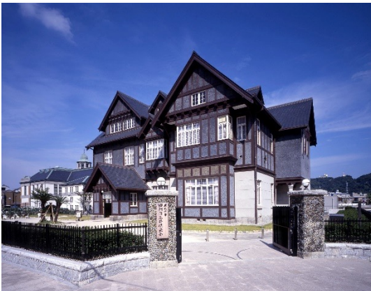
[Former Moji Mitsui Club]

We can see the twin cities (Kitakyushu-city on Kyushu island and Shimonoseki-city on main island of Japan) connected with the Kanmon bridge crossing the Kanmon Strait.