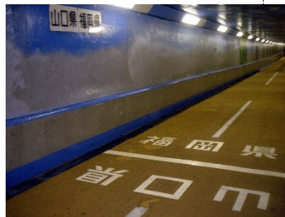
[Kanmon Pedestrian Tunnel]

This building was built in 1921 as a place to house important guests of MITSUI & CO., LTD. Dr. Einstein stayed here with his wife during their visit in 1922. There is memorial rooms for Dr. Einstein on the second floor.