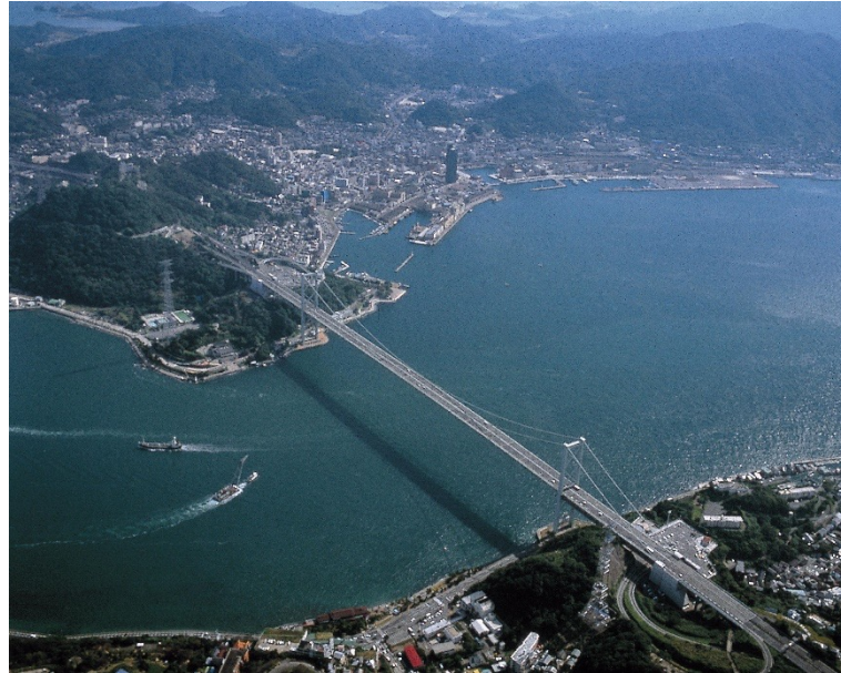
[Kanmon Strait and Kanmon Bridge]

JR Mojiko Station first opened on February 1, 1914. The symmetrical wooden structure was built in the neo-Renaissance style. In 1988, the building became the first railway station designated as a national cultural property.