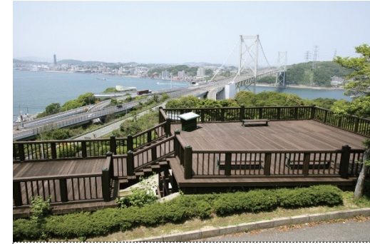
[Mekari Second Observation Deck]

We can see the twin cities (Kitakyushu-city on Kyushu island and Shimonoseki-city on main island of Japan) connected with the Kanmon bridge crossing the Kanmon Strait.